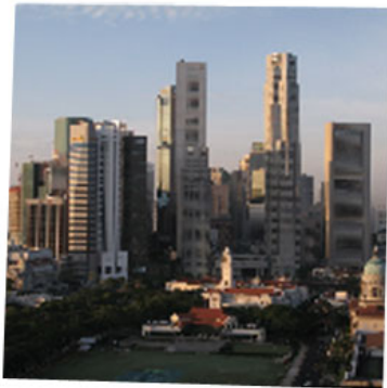
Host City: Singapore

Singapore may be just a dot on the atlas, but it is located at a geographical vantage point where the world connects to live, work and play. Singapore is one of the world's most developed economies with about 7,000 resident multinational companies and 100,000 enterprises, creating a continuously vibrant business environment. It is a convergence of robust technologies, a hub of exemplary minds and talents.